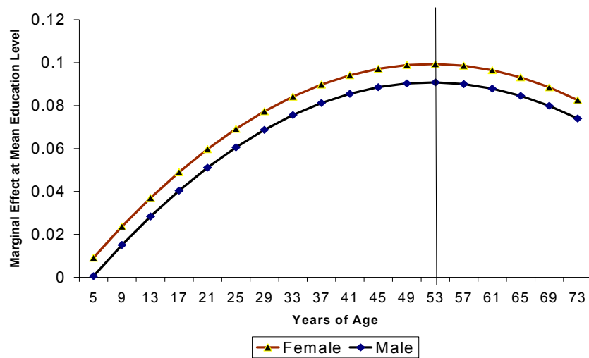
Figure 3: Marginal Effect by Age

To determine wealth status of the household, we collected a list of assets for each household. Using this list, the wealth index that was developed provides a relative scale on wealth for each household in terms of wealth status. The maximum value of the index is 100 and the minimum value is 0. A total of 43 types of assets were included in the calculation of the index. Of the 43 assets, 32 were listed as household assets and the other 11 were listed as productive assets. We present the wealth distribution of the sampled households in Fig. 3.